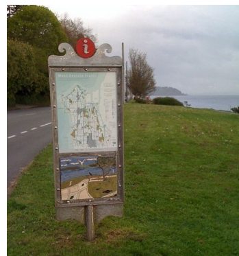
Sample Wayfinding approaches