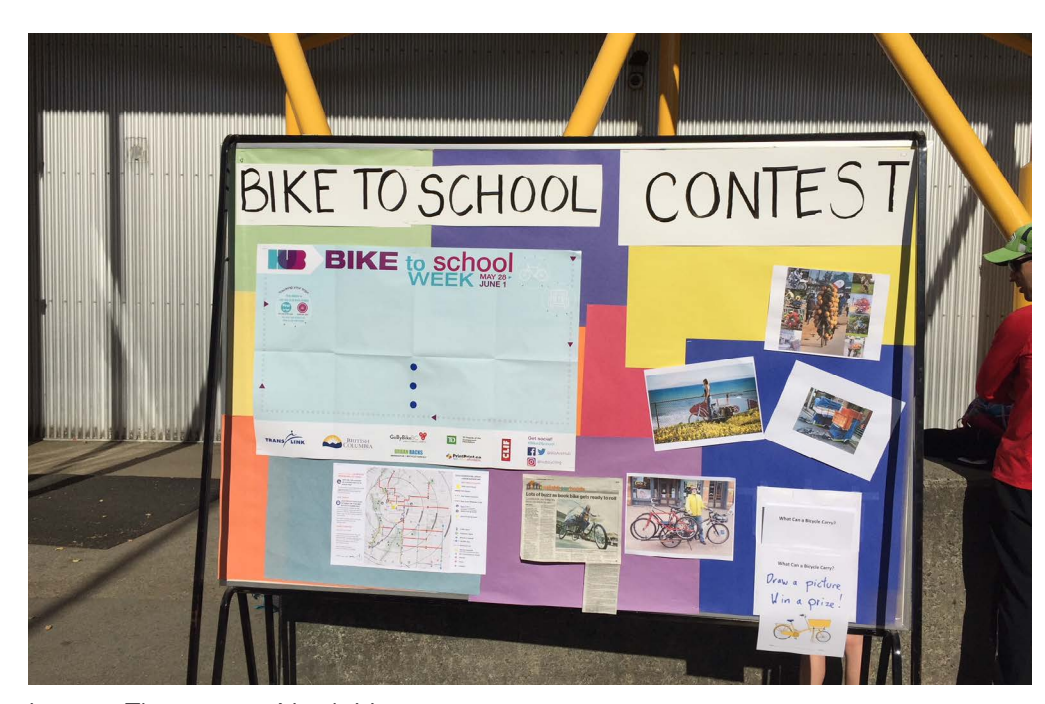
Larson Elementary, North Vancouver