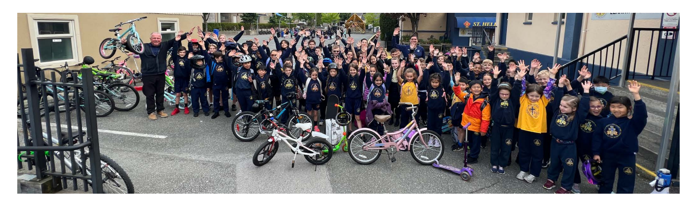
Bike to School Week 2022 at St. Helen's Elementary, Vancouver