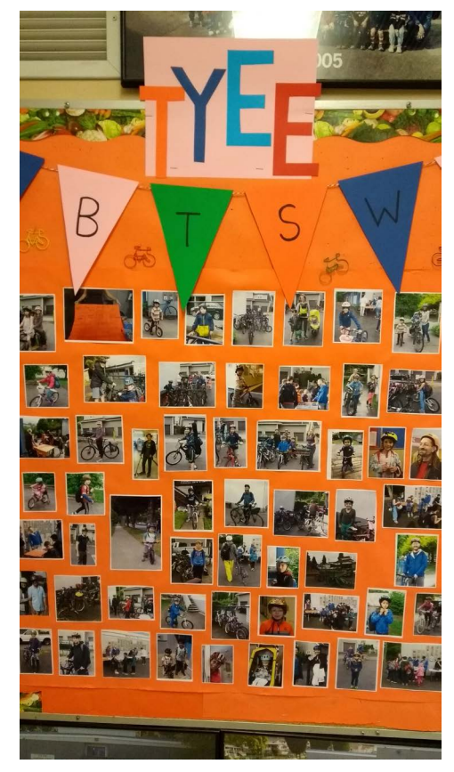
Tyee Elementary, Vancouver