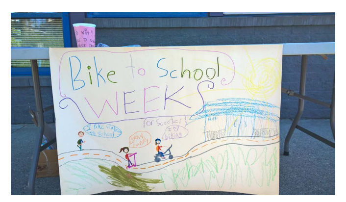
Riverview Park Elementary, Coquitlam