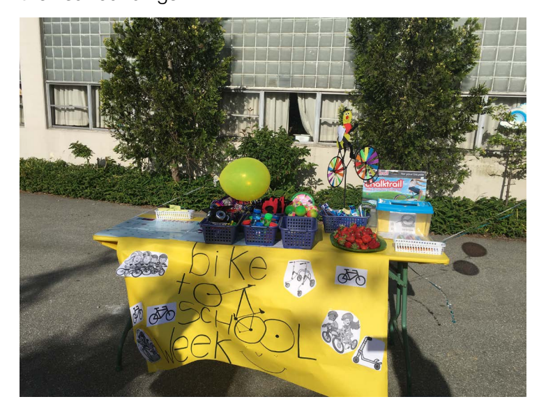
Bike decorating station at Southlands Elementary, Vancouver

Playing I-SPY on the way to school using activity sheets (like <u>these developed by Ontario Active School Travel for Winter Walk Day</u>) will be a hit with primary students and will encourage them to pay attention to their surroundings.