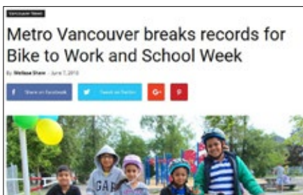
Vancouver Is Awesome – June 7, 2018

Bike to School Week received positive media attention across Metro Vancouver, appearing in 15 news stories leading up to and after the event.