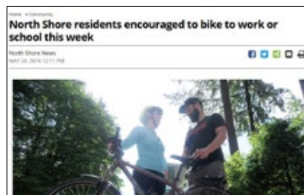
North Shore News – May 28, 2018