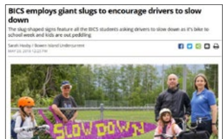
Bowen Island Undercurrent – May 29, 2018